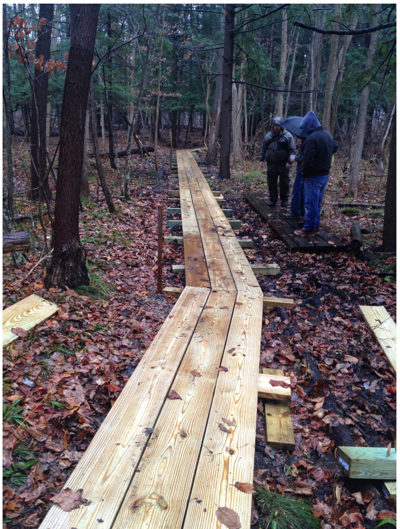
A section of boardwalk completed by the Order of the Arrow scouts on Nov. 2, 2013.