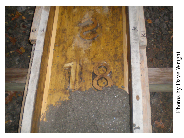
The form for mile marker 81. This one will be located on the Auburn Trail in Farmington.