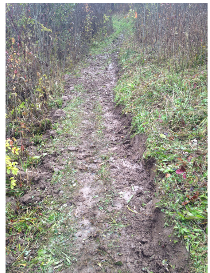
A section of the Seneca Trail at The Apple Farm that got some cut and fill by the Order of the Arrow scouts on Nov. 2, 2013.