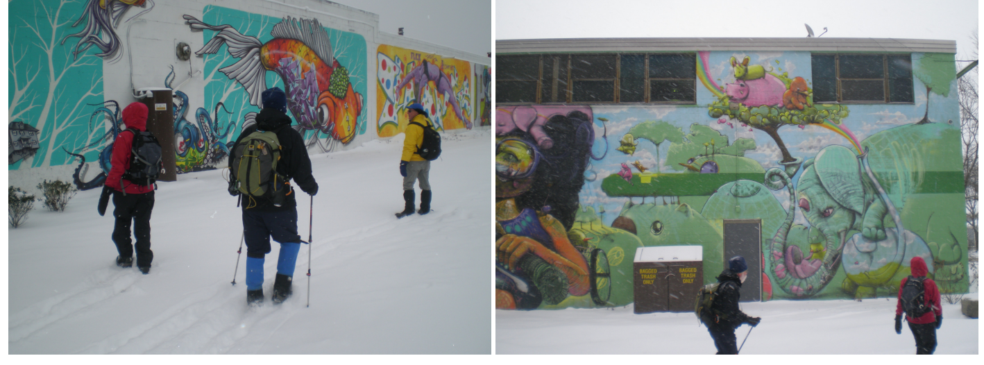
One of several murals along the El Camino Trail in Rochester, NY